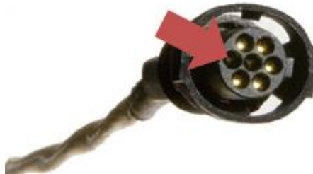
Figure 4: Misaligned power harness pins, caused by an unsecured strain relief on the power harness

If you have any questions or if your power harness has become damaged and requires repair, please contact Appareo Support for assistance.