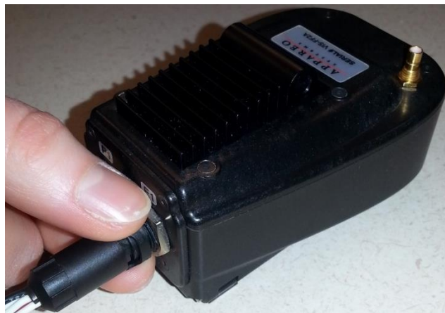
Figure 2: Squeeze the flat sides of the power harness connector together when removing it from the Vision 1000