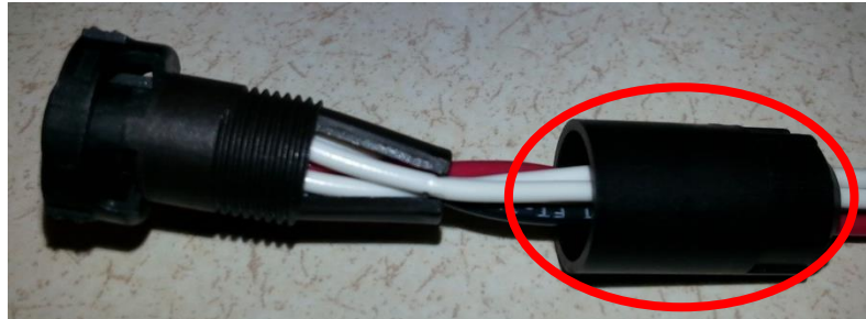
Figure 3: The strain relief (circled in red) unscrewed from the power harness

WARNING: Do not bend, twist, or screw the power harness connector. Doing so can damage the Vision 1000 P1 port or power harness connector. If the power harness's strain relief is unscrewed from the rest of the power harness, as shown in Figure 3. Strain reliefs not in the correct position on the power harness can cause the power harness pins to become misaligned, as shown in Figure 4. Power harnesses with misaligned pins cannot correctly connect with the Vision 1000 P1 port.