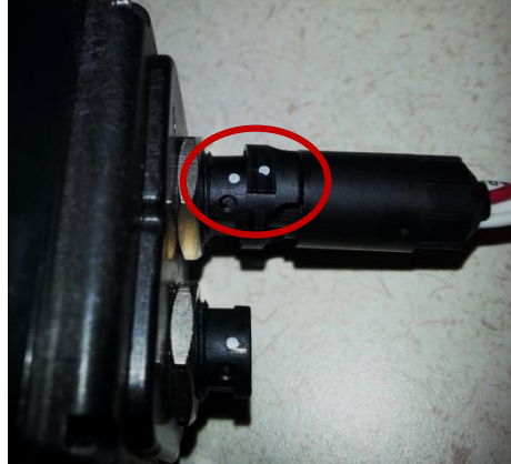
Figure 1: Line up the white dots on the power harness connector with the Vision 1000 P1 port. The white dots are circled in red.